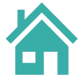
Homeless Support Services