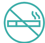
Tobacco Cessation & Substance Use