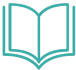
Early Childhood Health & Education