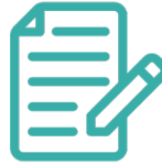
Grant Writing & Submission