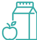
Nutrition & Obesity Prevention